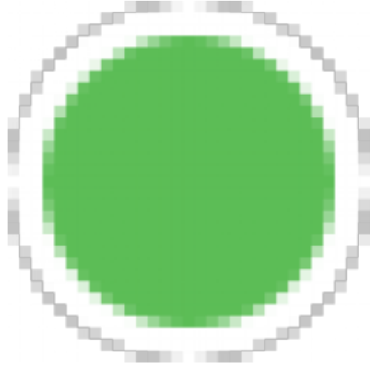
PLA Translucent Grn