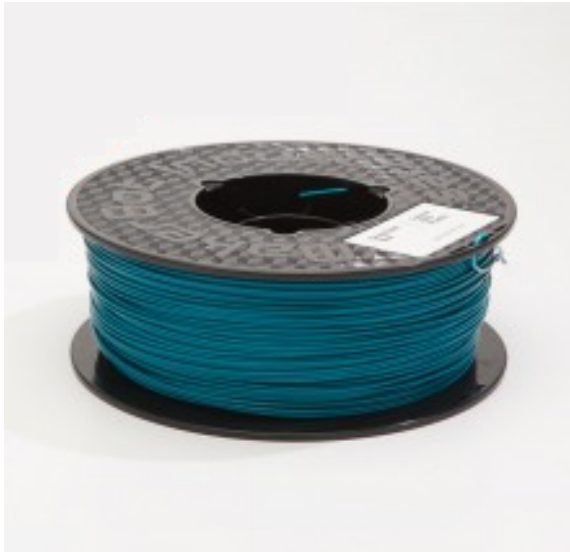
ABS Deep Dark Teal