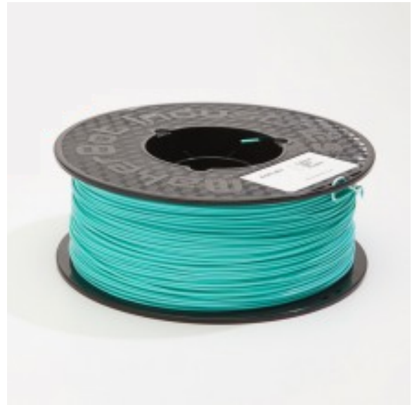
ABS Acid Lake